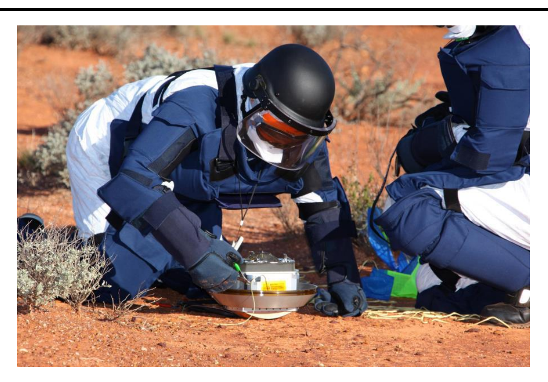
Figure 5. Hayabusa return capsule safing of batteries

The selection of PPE for staff collecting and ERC after a non-nominal landing will depend on a risk assessment. The selection of PPE will be related to the estimated level of operator protection required, which in turn will depend on the likelihood of release of returned material and potentially against any decontaminant used. For example if one level of containment has been breached in the ERC then this would still not indicate a release of material to the atmosphere, this in turn would mean that normal PPE could be worn for collecting the ERC. If however there was a catastrophic failure of containment on landing then PPE that affords greater protection to the collecting staff should be selected.