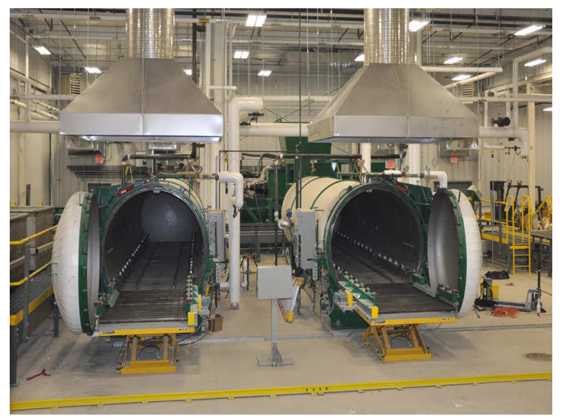
Figure 12 shows large medical waste autoclaves. Note the rollers to allow access of large containers.

Within the laboratory/healthcare setting moist heat under pressure (autoclaving) is used to sterilise equipment that is heat stabile [30]. This process has been used previously for the decontamination of soil [31-33], but limitations of soil autoclaving show that with incomplete sterilisation, respiration rates within the soil rapidly return to the untreated levels [34]. But for complete inactivation of bacteria and fungi within the soil tested 2 applications were necessary [35]. Larger autoclaves are available for use, Figure 12, but these are installed in a facility and need large amounts of power and steam to operate, such as provided from Bondtech Corporation, USA. These large autoclaves are able to process approximately 1,000Kg/hr but validation will be required to ensure the cycle parameters are efficacious.