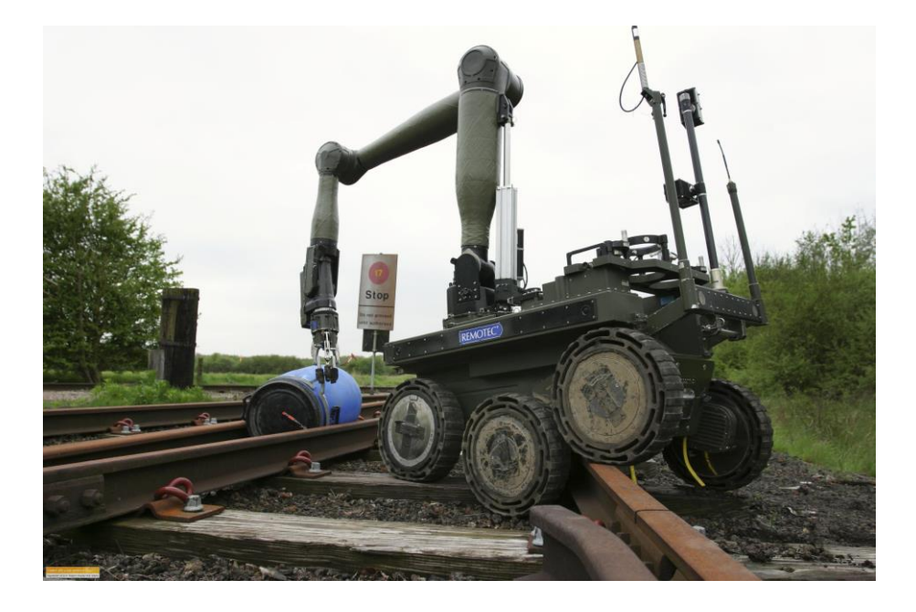
Figure 7. A CUTLASS robotic system.

The collection of the ERC could be undertaken remotely using robots to reduce the potential for the direct exposure of the workers during the collection process. Currently remote operation of robots is used for the identification and disposal of bombs and improvised explosive devices. The CUTLASS programme designed by Northrop Grumman (Figure 7) shows a robotic system currently used by the UK Ministry of Defence.