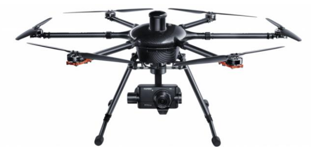
Figure 8. A remote controlled drone with camera.

Fine manipulation tasks will be easily achieved using the robotic system, if the correct adaptions were available for the task. It would be envisaged that a lifting device would be required for the larger sample return missions such as Chang'e 5, with a capsule mass of approximately 600kg. The robot system can be modified further to suit the type of terrain that will be found in the landing site, for example tracks could be fitted as opposed to tyres to allow access to finer soil/sandy areas.