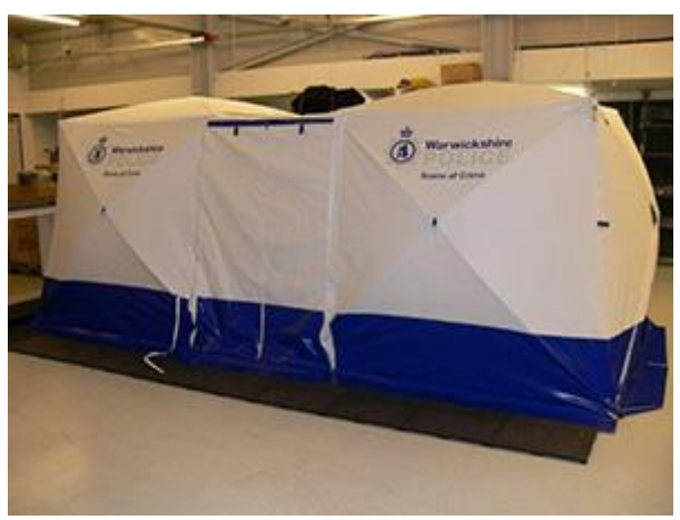
Figure 9. A forensic tent used to cover a crime scene.