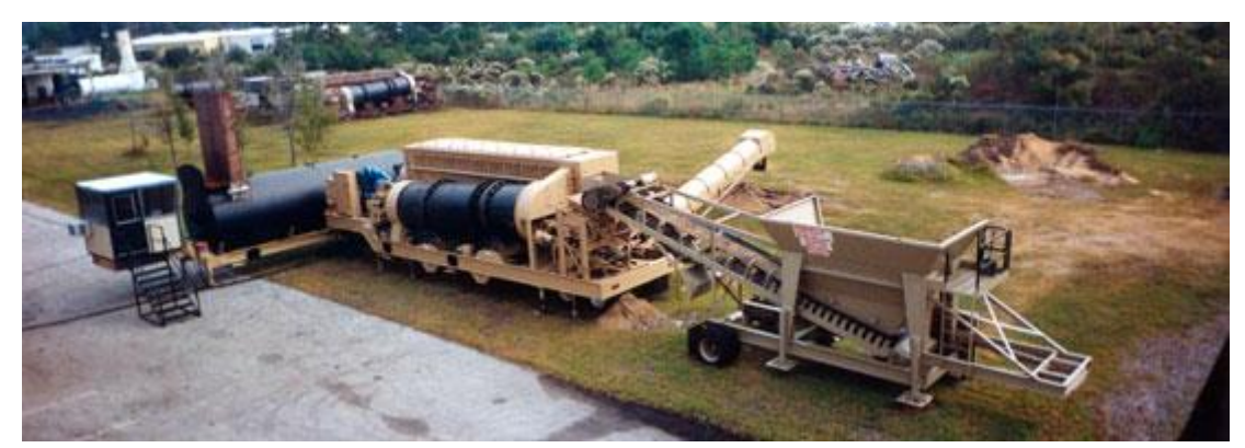
Figure 11. A Portable SRU 855 soil decontamination unit.

Physical decontamination methods will impart physical energy on the soil of the landing site to inactivate the organisms within it. Such methods include incineration of the soil, but generally these approaches will only be able to process soil in small batches. The costs can be high with a ton of soil estimated to cost approximately $500 dollars to be incinerated [28]. Mobile incinerators can be transported to the site and used to incinerate soil at the landing site, but this will require a large amount of ancillary equipment to complete. A mobile incinerator may not be able to meet the capacity needed and a more permanent incinerator could be constructed at the site or close to it to reduce the transportation needed for the contaminated material. This approach was decided upon during an anthrax outbreak in a Swedish cattle heard, where an incinerator was constructed on site at a cost of approximately $9 million to incinerate the cattle, feed, bedding and buildings of the farm, around 1350 tonnes of mass [29].