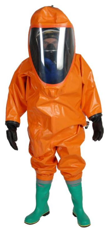
Figure 6. A GTB reusable gas tight suit.

Radiological and Nucleotide threats. These suits are designed to be rapidly donned and used for an extended period of time. The suit is sealed round the respirator by the hood in the upper half of the suit.