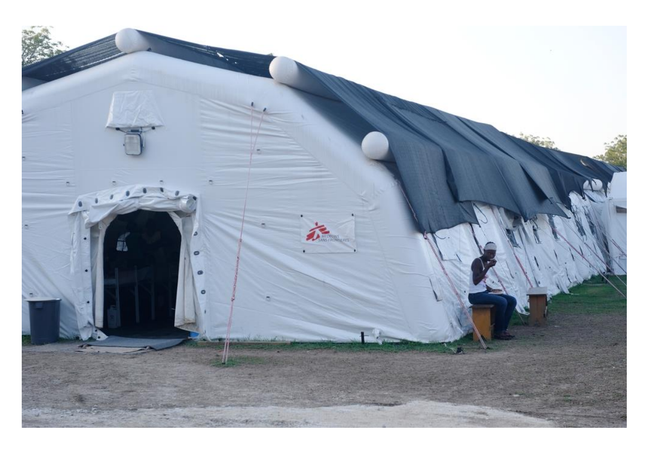
Figure 10. An inflatable structure used by Medicins Sans Frontieres for a hospital after an earthquake in Haiti.

Figure 9. A forensic tent used to cover a crime scene.