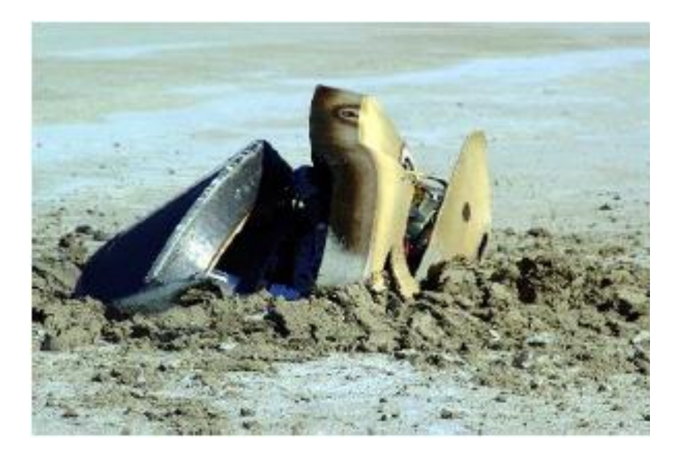
Figure 3. The genesis capsule after impact with the ground.

Failure of the parachute's integrity or deployment could lead to a ballistic landing at a velocity that will cause failure or destruction of the ERC containment. This was witnessed during the Genesis mission where the drogue parachute failed to deploy after an accelerometer had been installed incorrectly and the ERC was only slowed down by its own air resistance, leading to a ballistic impact which the capsule was not designed to withstand [12], Figure 3. This would present a serious problem in terms of contamination of the immediate area with the returned samples and more widespread contamination from environmental factors (e.g. wind) if particles were small enough to be dispersed (Figure 4).